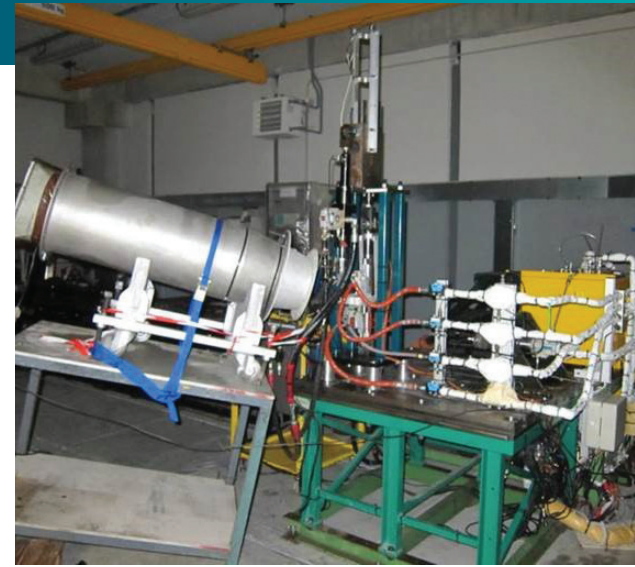
Hydraulic actuator test bench.

In the future, Genot and Lopez-Velasco plan to study different weather cases, work on transient calculations (not only for stationary analyses) and integrate a real-time platform with Simcenter Amesim.