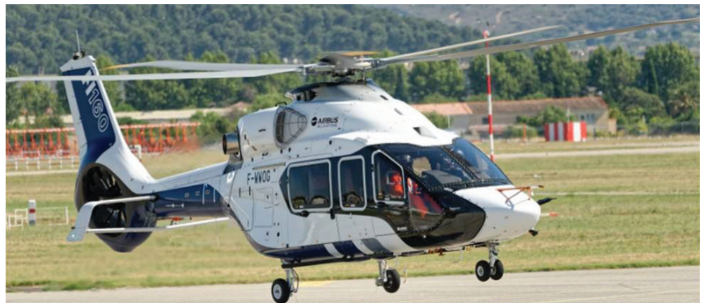
Airbus Helicopters H160 prototype in flight testing.

The thermal management of evaluating hydraulic circuits is part of the check list. First, Airbus Helicopters has to assess the integration of the circuit in the aircraft zones with the thermal impact without exceeding maximum defined temperatures. Further, it has to be certified there is a well-designed and working hydraulic circuit that can support proper flight command functioning even in case of failures (leakage, pump failure, etc.).